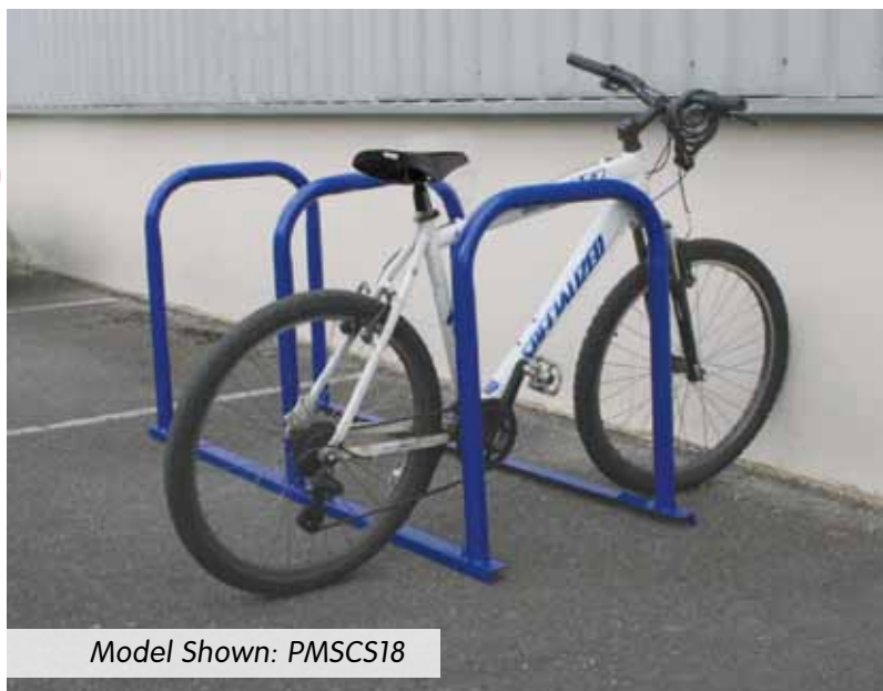
Model Shown: PMSCS18