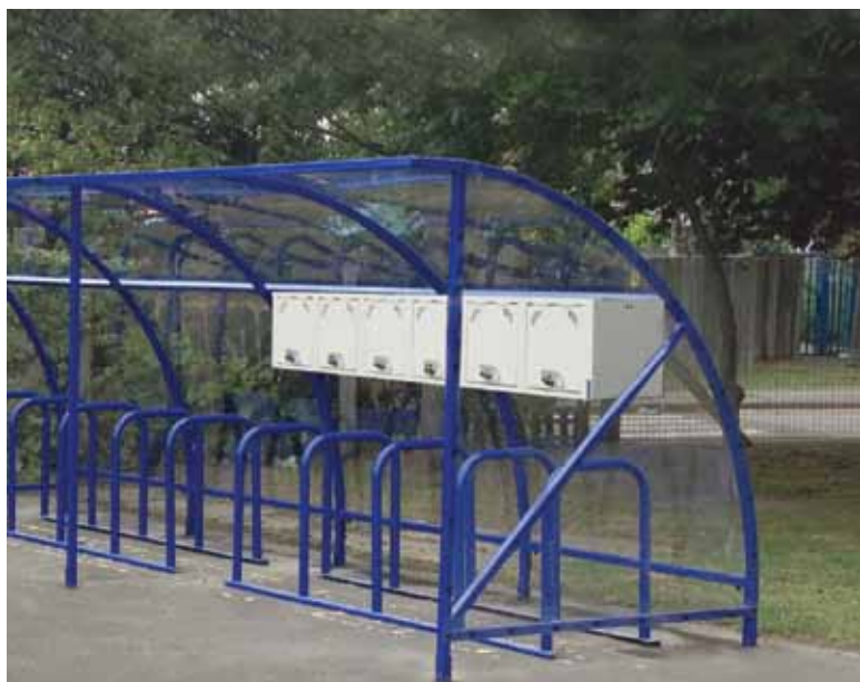
6-Tier Locker, located in a shelter