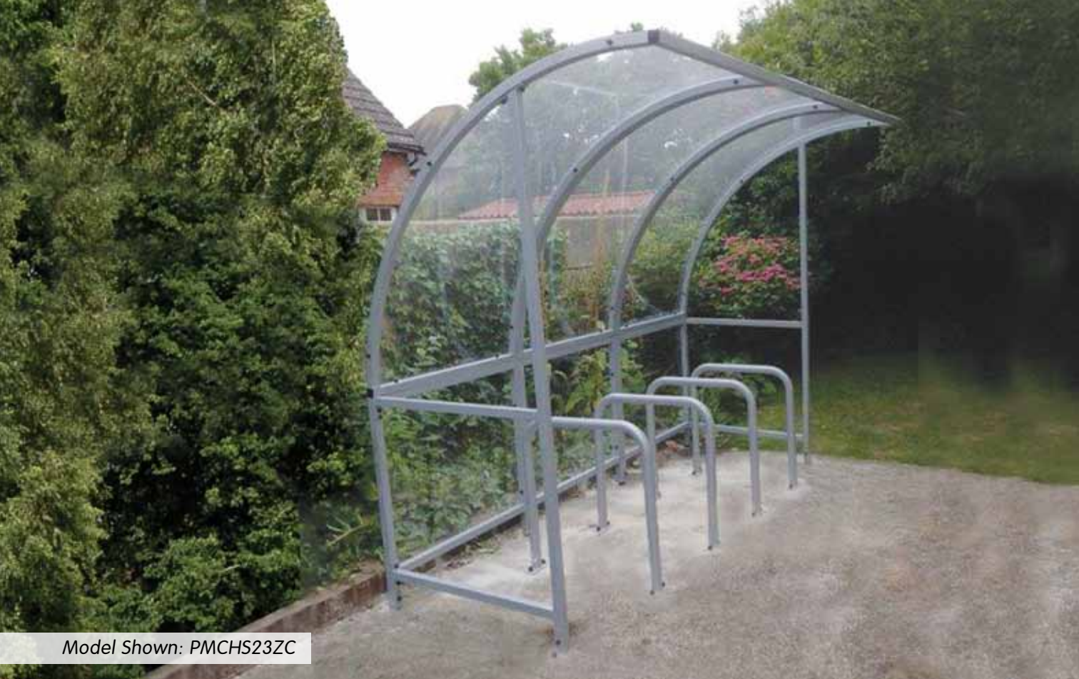
Model Shown: PMCHS23ZC