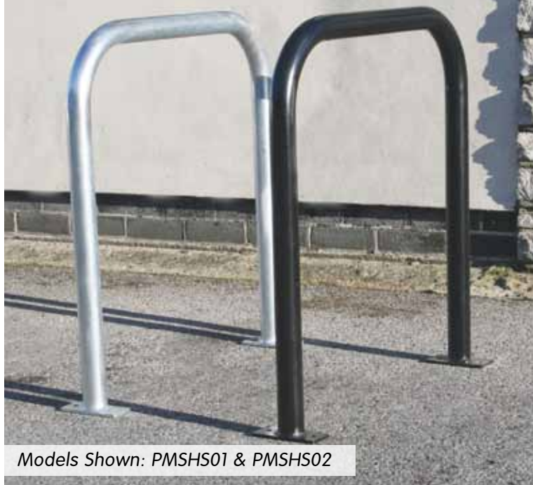
Models Shown: PMSHS01 & PMSHS02