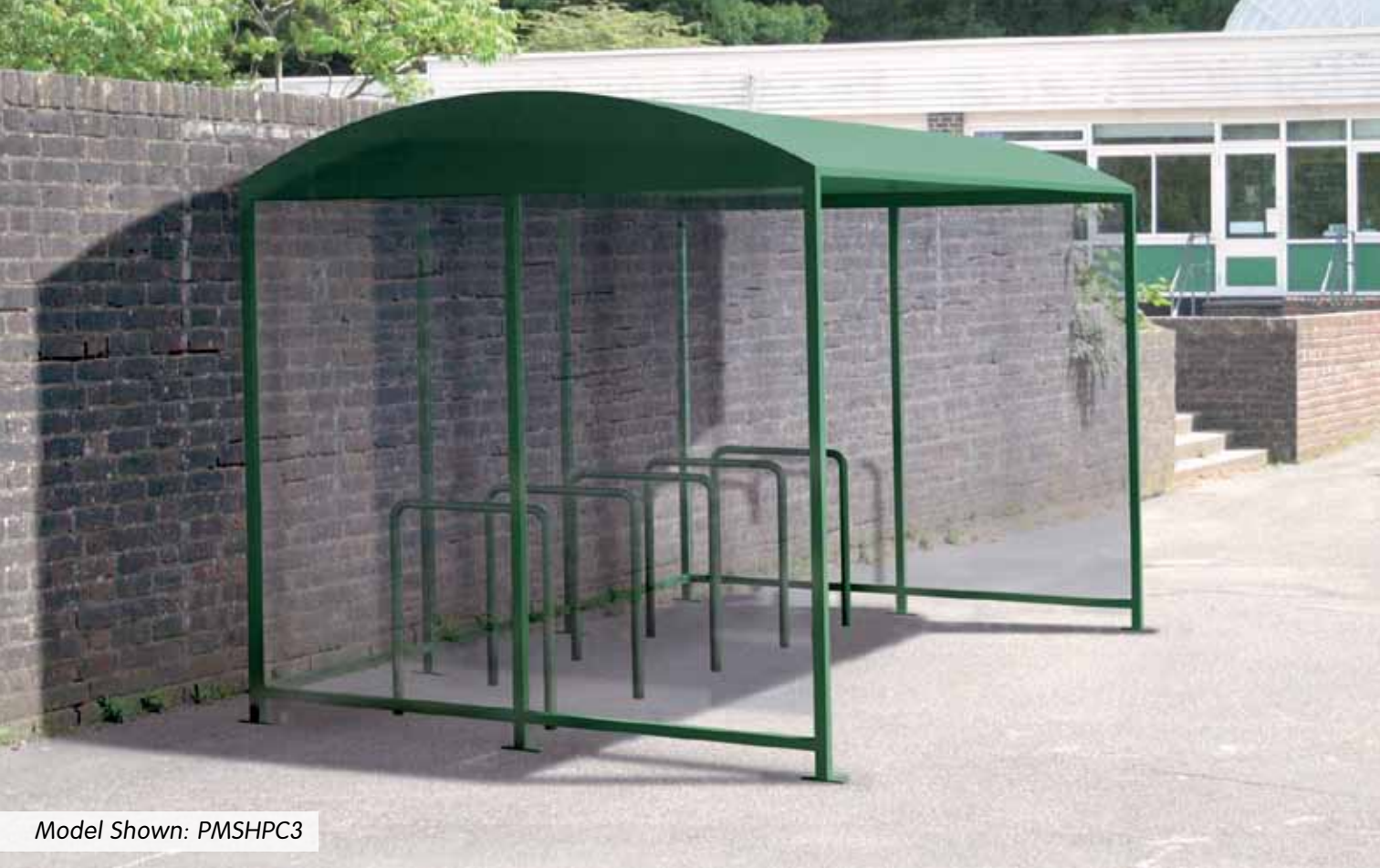
Model Shown: PMSHPC3