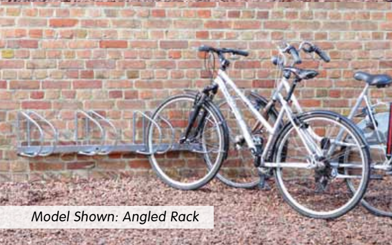
Model Shown: Angled Rack