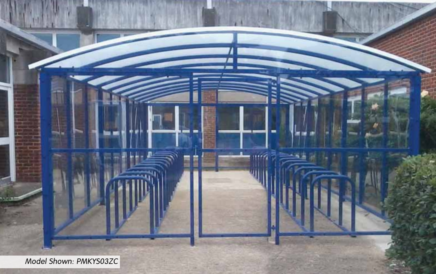
Model Shown: PMKYS03ZC