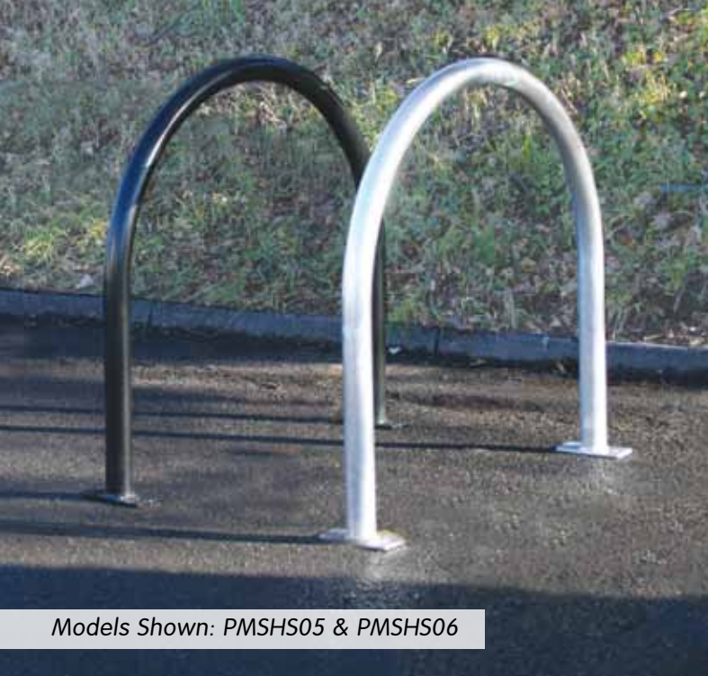
Models Shown: PMSHS05 & PMSHS06