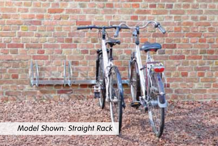
Model Shown: Straight Rack