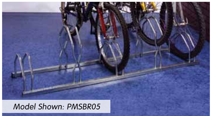
Model Shown: PMSBR05