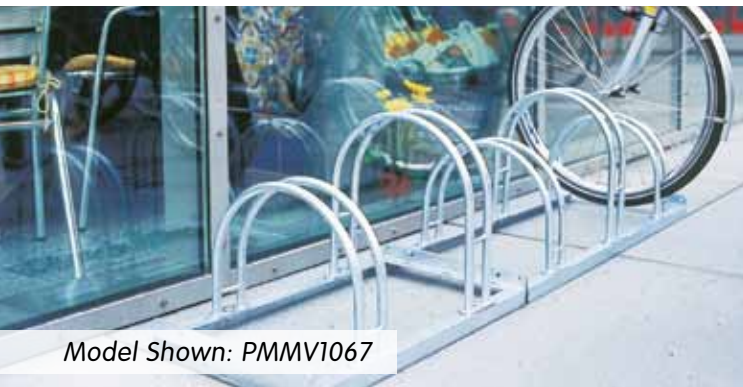
Model Shown: PMMV1067