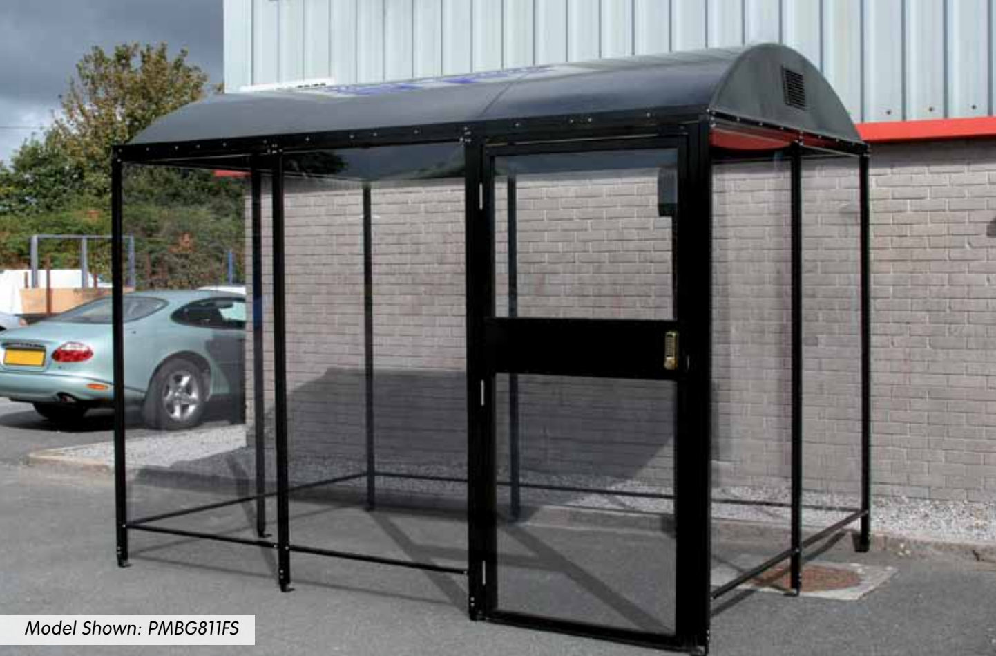
Model Shown: PMBG811FS