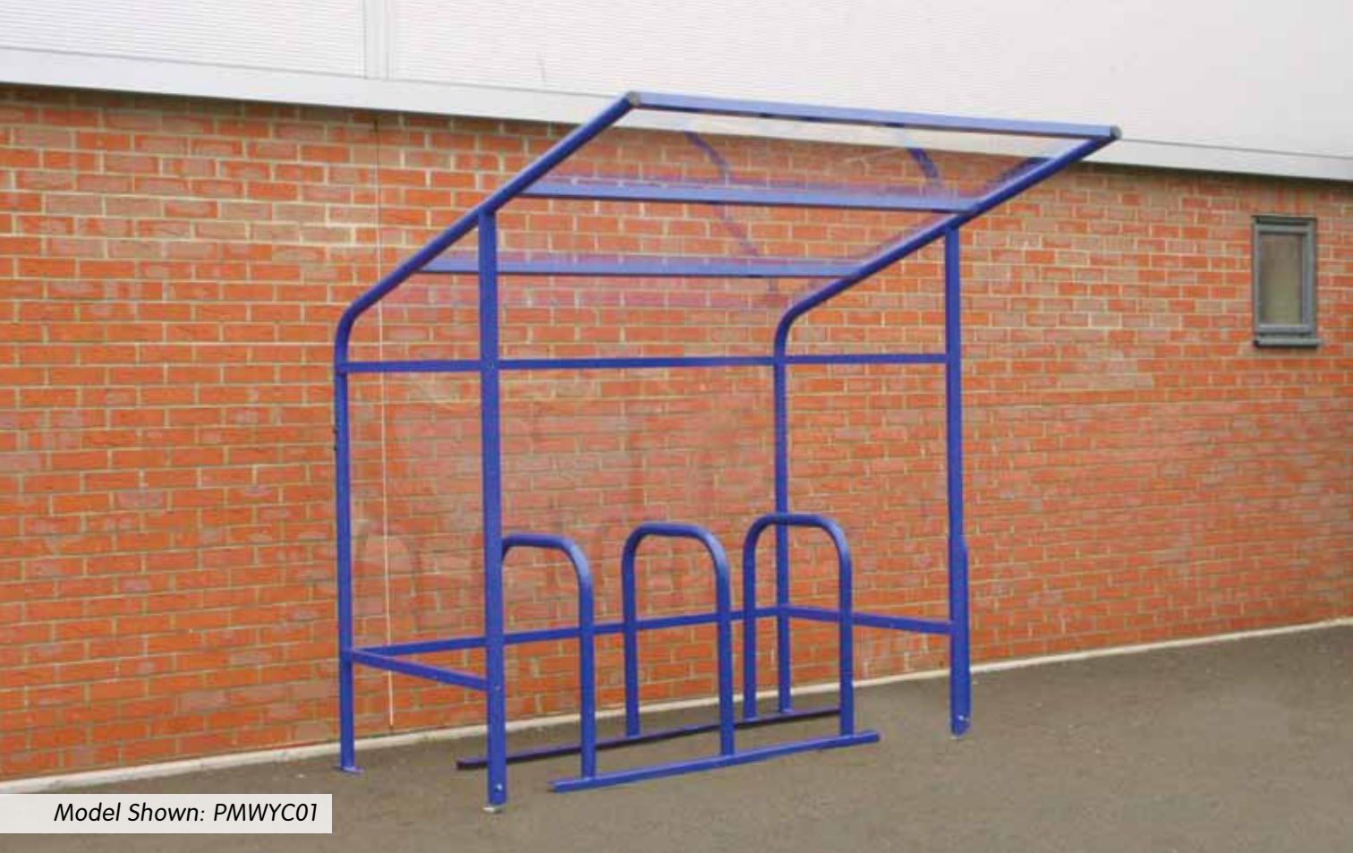
Model Shown: PMWYC01