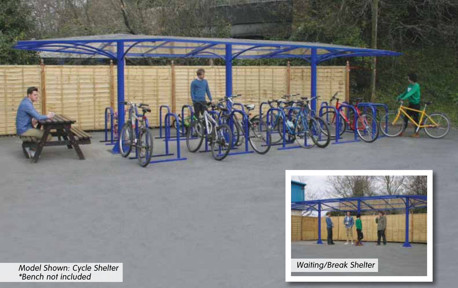
Model Shown: Cycle Shelter *Bench not included