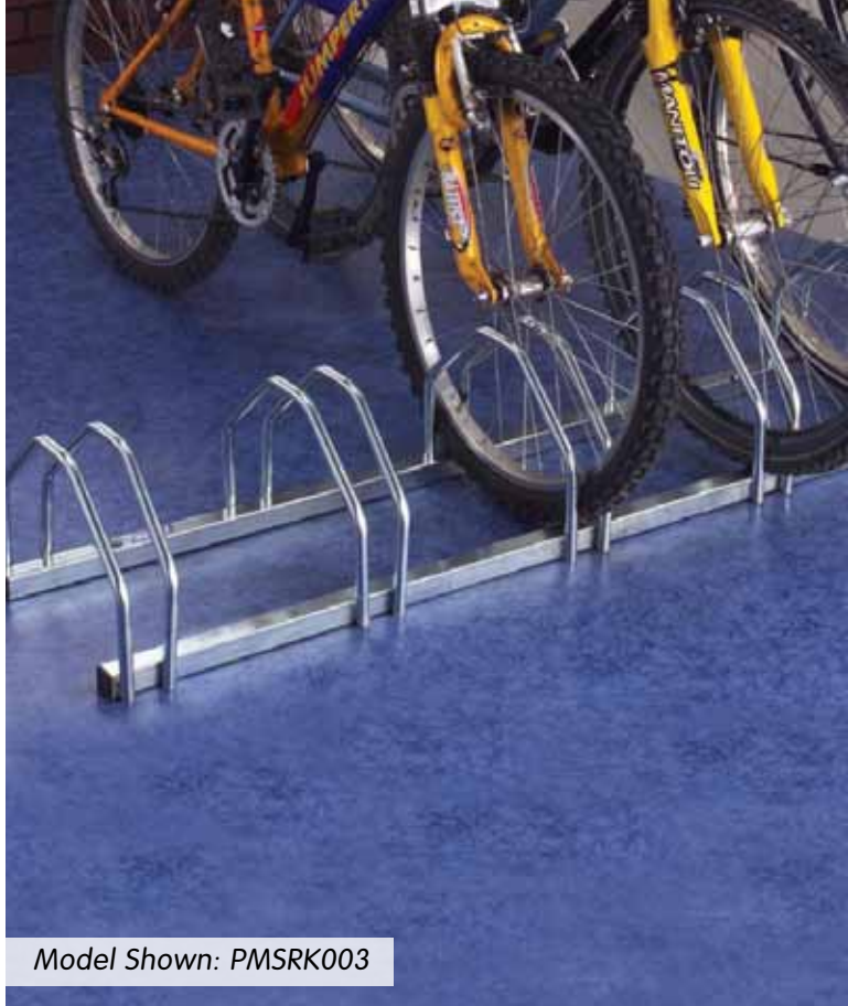
Model Shown: PMSRK003