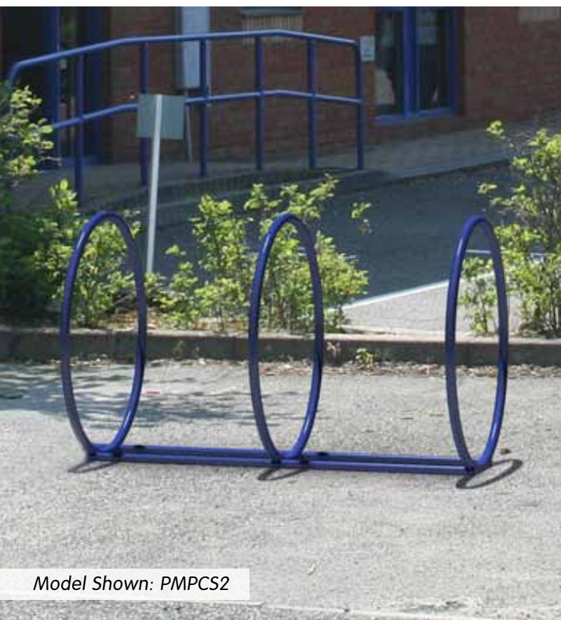
Model Shown: PMPCS2