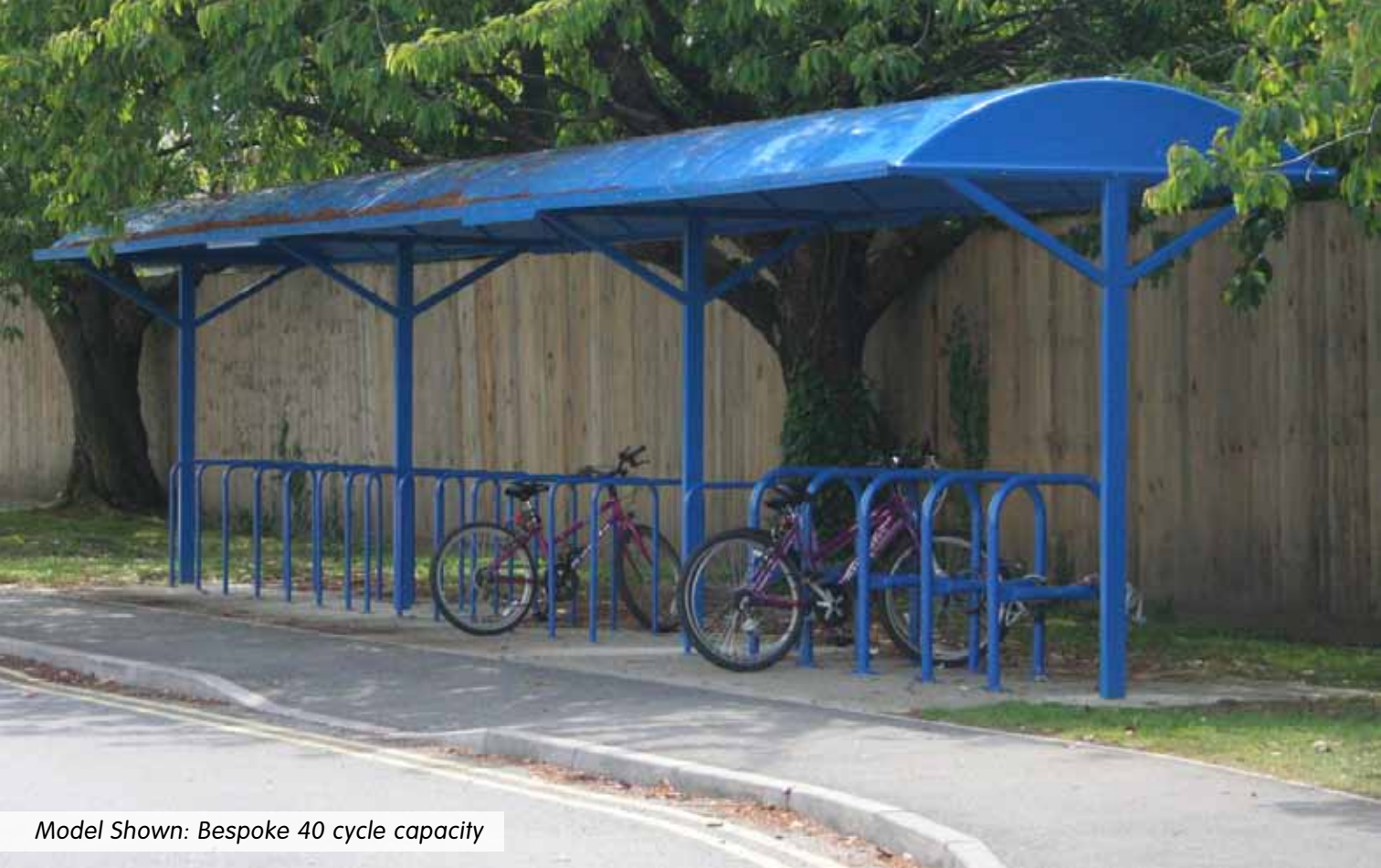
Model Shown: Bespoke 40 cycle capacity